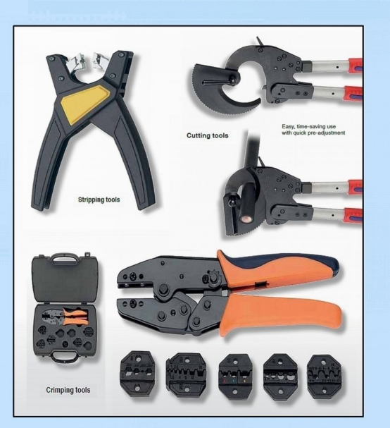
Assorted Cutting, Stripping & Crimping Tools