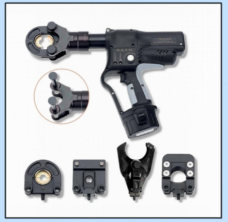
Variety of Crimping/Cutting Tool Systems