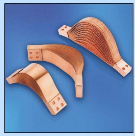
Braided & Laminated Flexible Connectors