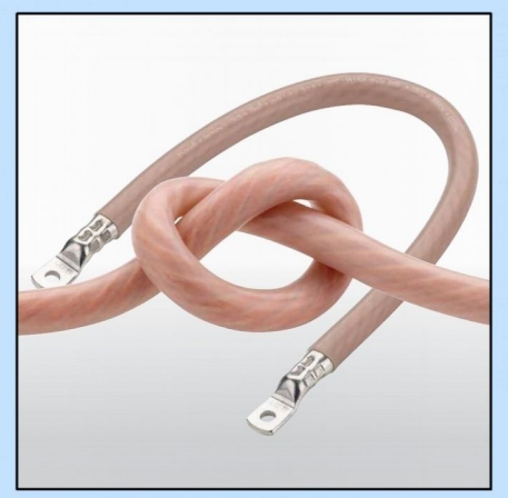
Extremely Flexible High Current Cables